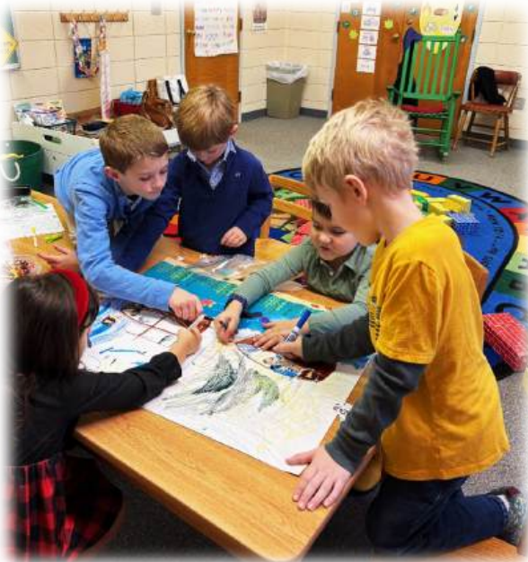
Working together to illustrate a Bible story in Sunday School.

Thank you to the Building and Grounds Committee for adding bulletin board strips in the hallway near the children's Sunday School rooms.