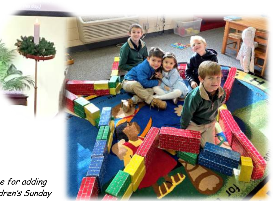
The children made a star for Epiphany.

Take the time to walk down the hall and you will see the children's work displayed.