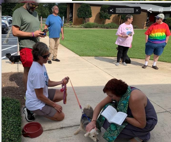
Blessing of the Animals 10-6-24